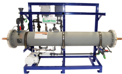
ClorTec® DN Gen II On-site sodium hypochlorite generator

ClorTec OSHG systems have been deployed at hundreds of frack stages for on-the-fly disinfection of frack water, multiple central batteries, recycling centers and saltwater disposal wells (SWDs). The technology, a critical component of a cost-effective produced water recycling process, is being successfully used by multiple operators, service companies, and water management entities.